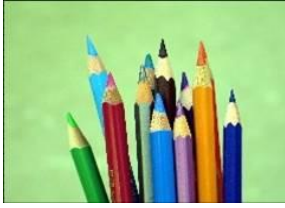
Art Lift Gloucestershire